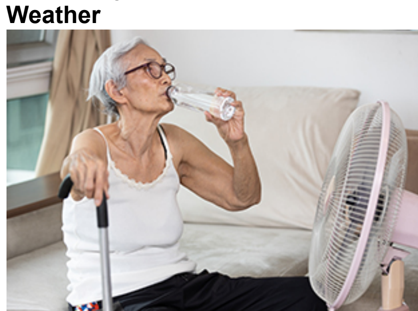
Severe heat may cause illness or even death. Lower your risk of heat illness with these tips: